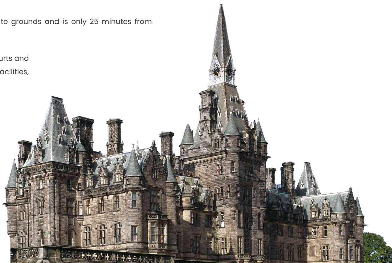
Fettes College - Bryce Building